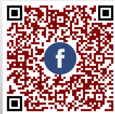
P&C families FB page

Keep an eye on the school newsletter, join the P&C families Facebook page and Qschools to stay up to date with new events